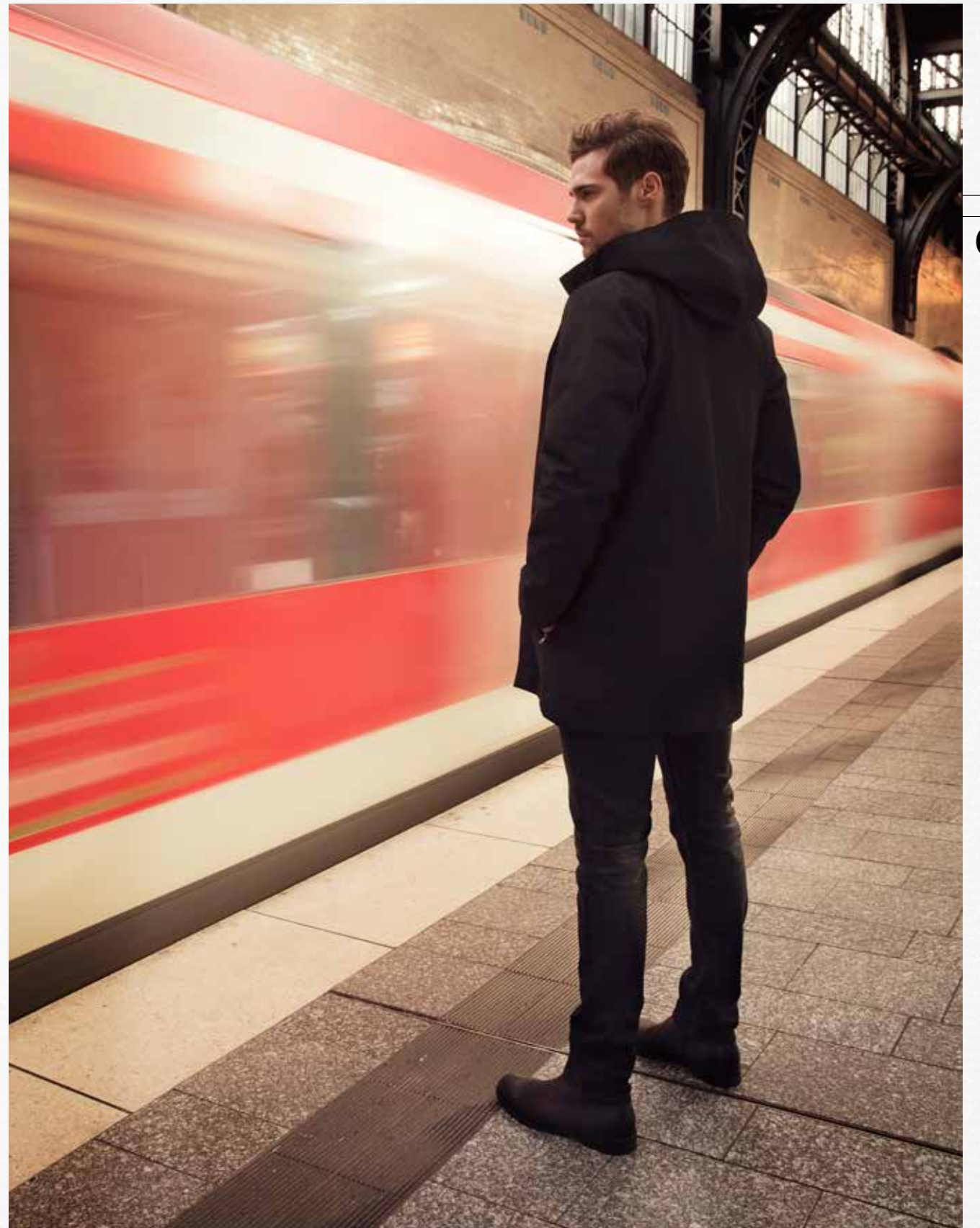
Jacket 500947 * Shirt 500674 * Jeans 500766