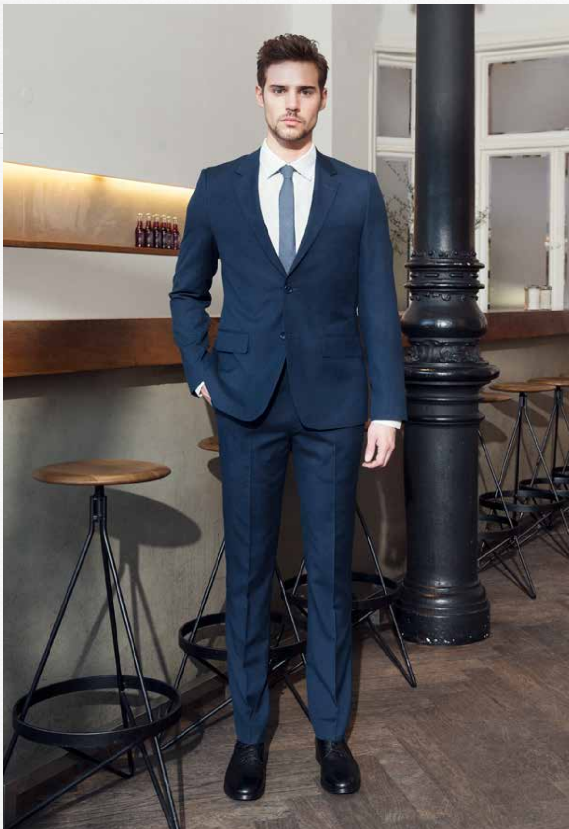
Blazer 500751 * Shirt 500946 * Pants 500749 * Tie 500728