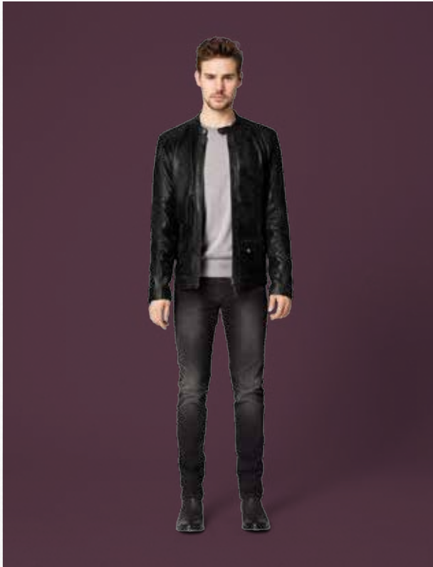
Jacket 500649 Knit 500945 Jeans 500766