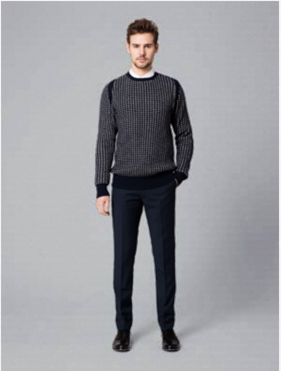
Pullover 500817 Shirt 500946 Pants 500749