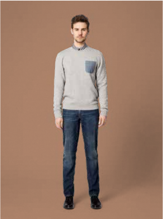
Sweatshirt 500951 Shirt 500796 Jeans 500759