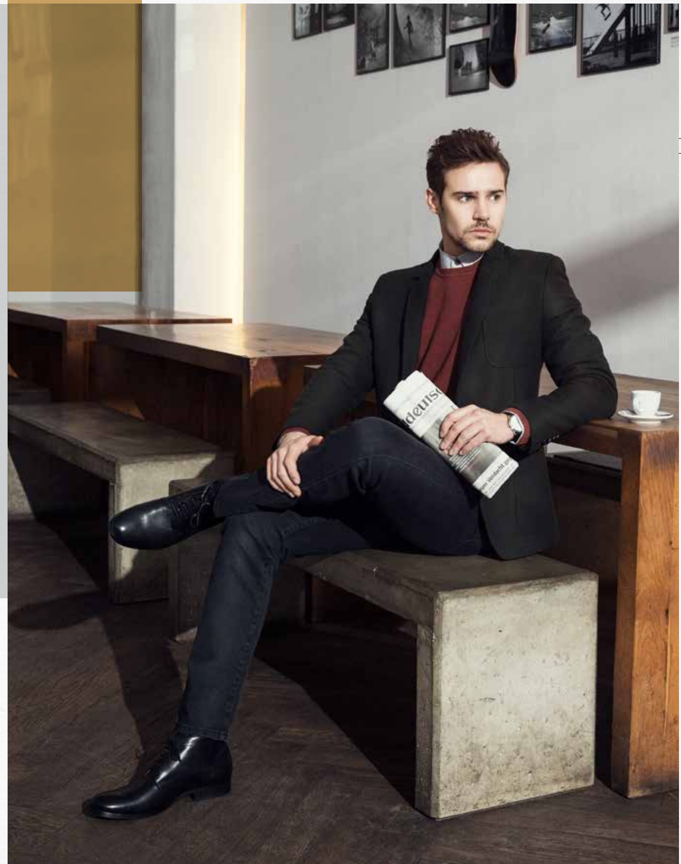
Blazer 500746 * Pullover 500934 * Shirt 500919 * Jeans 500918