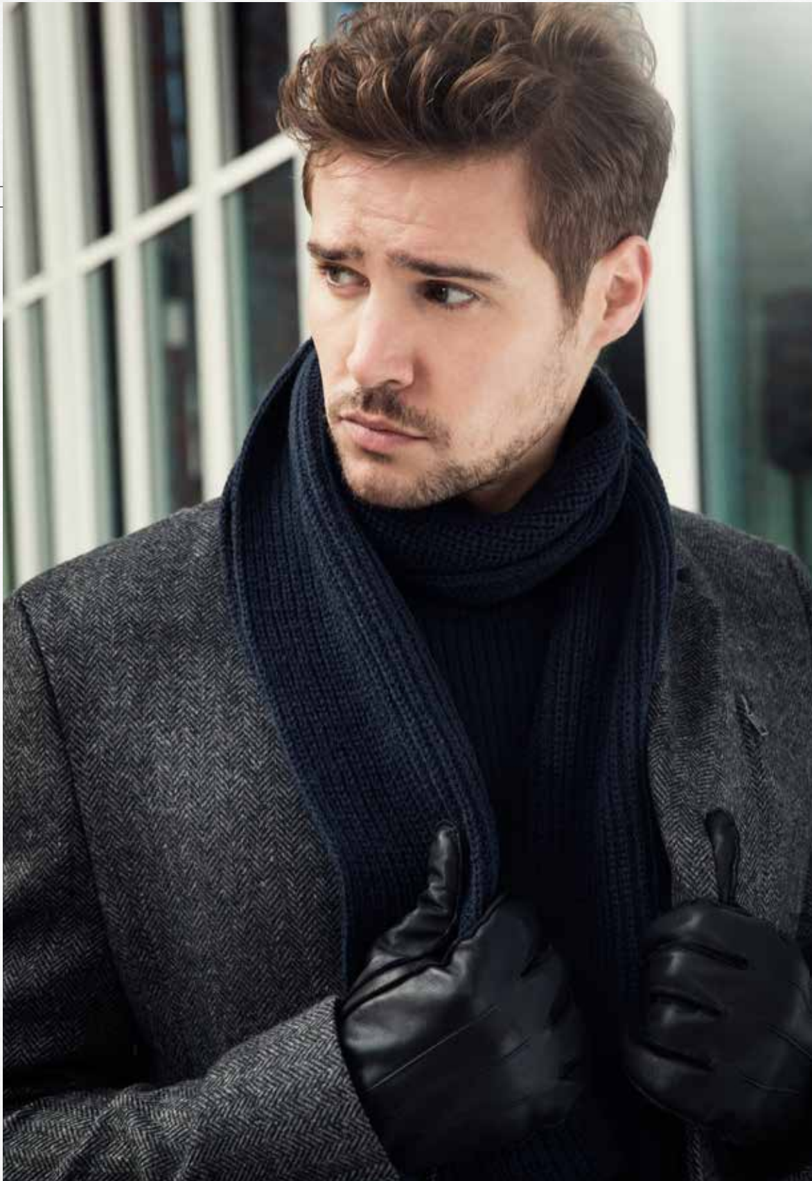
Jacket 500948 * Pullover 500932 * Scarf 500888