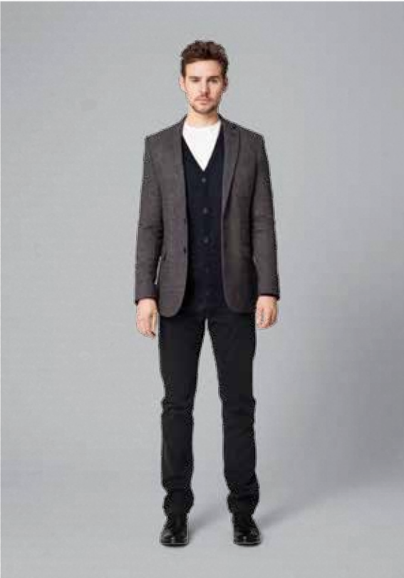
Blazer 500747 Cardigan 500695 T Shirt 500958 Jeans 500918