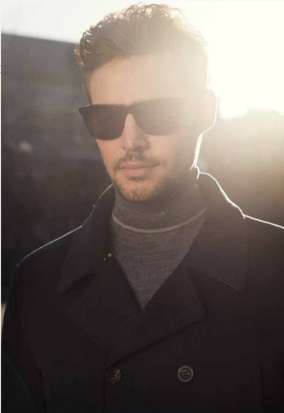
Jacket 500654 * Turtleneck 500688