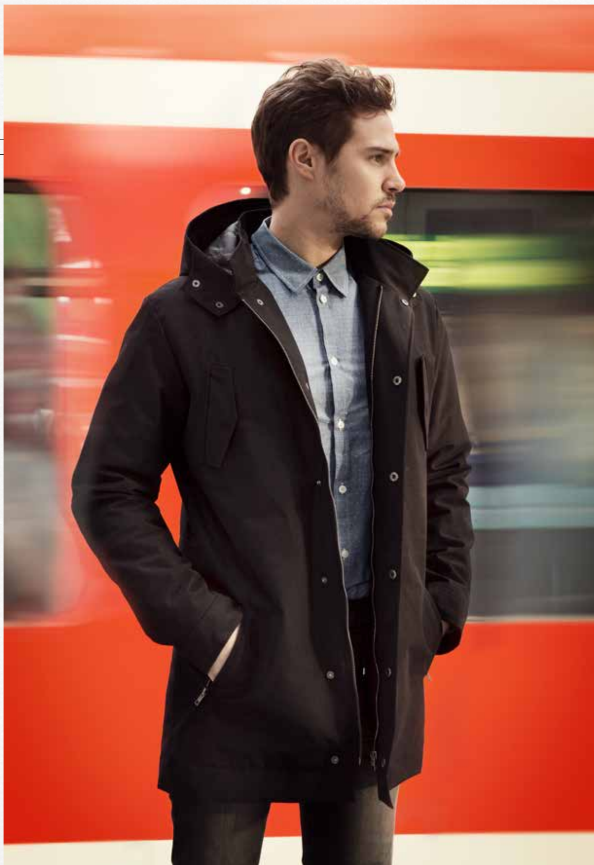
Jacket 500947 * Shirt 500674 * Jeans 500766