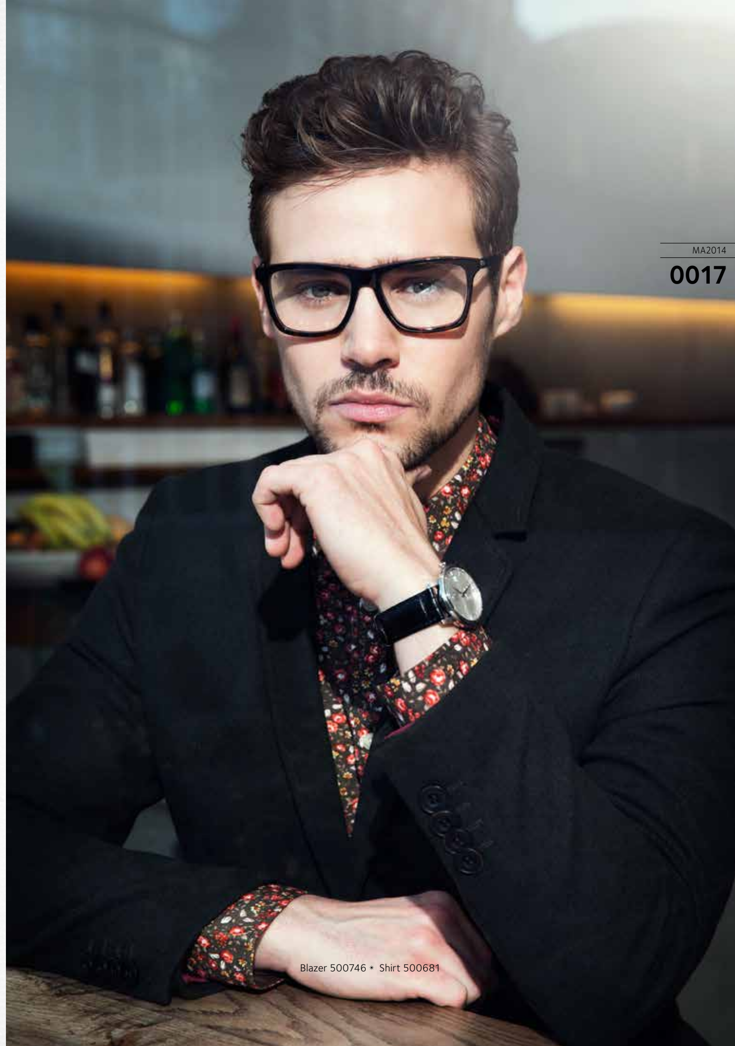
Blazer 500746 * Shirt 500681