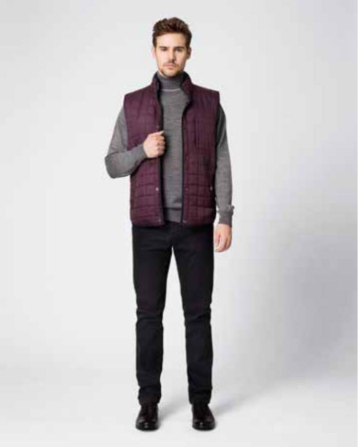
Vest 500651 Turtle neck 500688 Jeans 500918