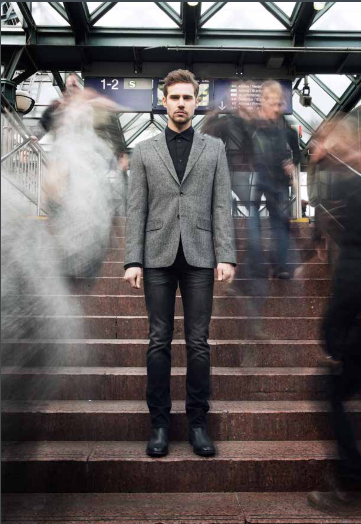
Blazer 500916 * Shirt 500946 * Jeans 500766